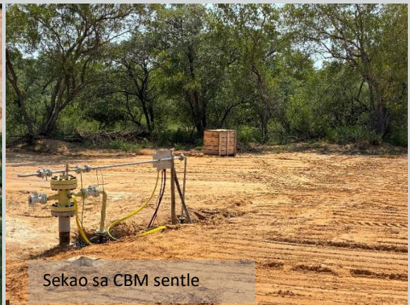
Sekao sa CBM sentle