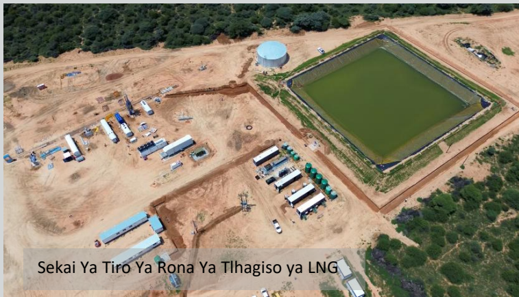
Sekai Ya Tiro Ya Rona Ya Tlhagiso ya LNG