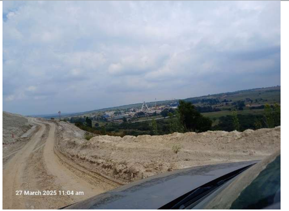
Figure 7: View of the adjacent land uses to the northwest of the study area.