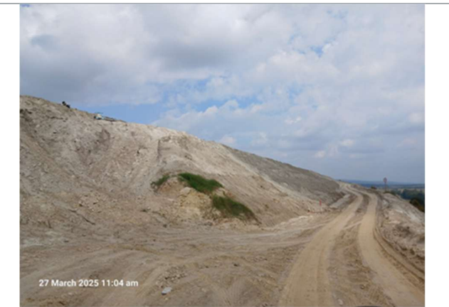
Figure 6:View of the side slope of the top of the Savuka 7a & 7b TSFs to the north