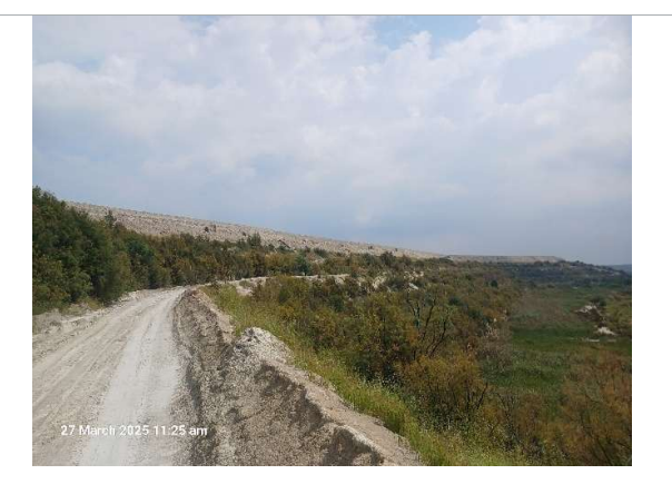
Figure 21: Vegetation on the side slopes of the TSFs. Photograph taken from the upper road of the TSFs to the east of the TSFs towards the north.

Figure 20: View of the valley between the Savuka 7a & 7b and the Savuka 5a& 5b TSFs towards the north. The Savuka 5a&5b TSFs can be seen in the background across the valley.