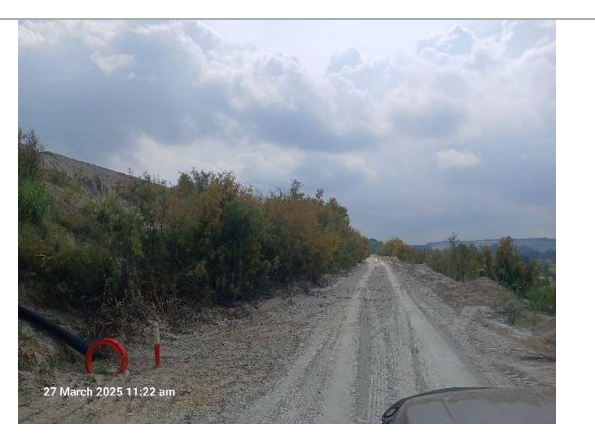
Figure 17: Vegetation on the side slopes of the TSFs. Photograph taken from the upper road of the TSFs to the south-east of the TSFs.