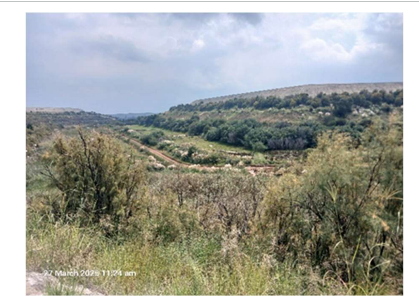
Figure 20: View of the valley between the Savuka 7a & 7b and the Savuka 5a& 5b TSFs towards the north. The Savuka 5a&5b TSFs can be seen in the background across the valley.