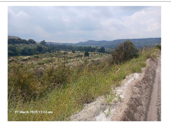
Figure 18: View of the valley between the Savuka 7a & 7b and the Savuka 5a& 5b TSFs towards the east.