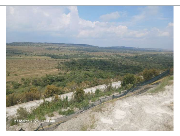
Figure 13: View from the road on the TSFs to the south of the study area towards the west. The netting for dust mitigation is visible in the foreground on the side slopes and the existing plantation for phytoremediation in the background.