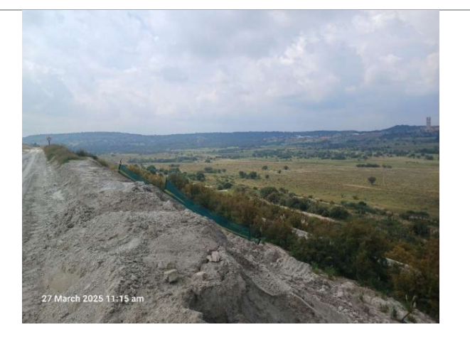
Figure 15: View from the road on the TSFs to the south of the study area towards the east. The netting for dust mitigation is visible in the foreground on the side slopes of the TSFs.