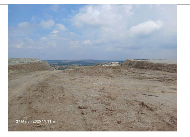
Figure 11: View of the road on top of the TSF between the Savuka 7a & 7b TSFs, looking east.