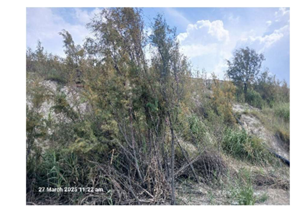
Figure 16: Vegetation on the side slopes of the TSFs.