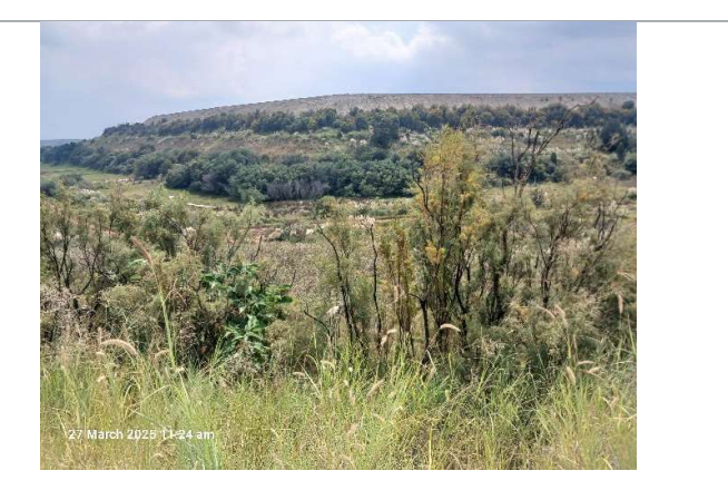
Figure 19: View of the valley between the Savuka 7a & 7b and the Savuka 5a& 5b TSFs towards the north-east. The Savuka 5a&5b TSFs can be seen in the background across the valley.