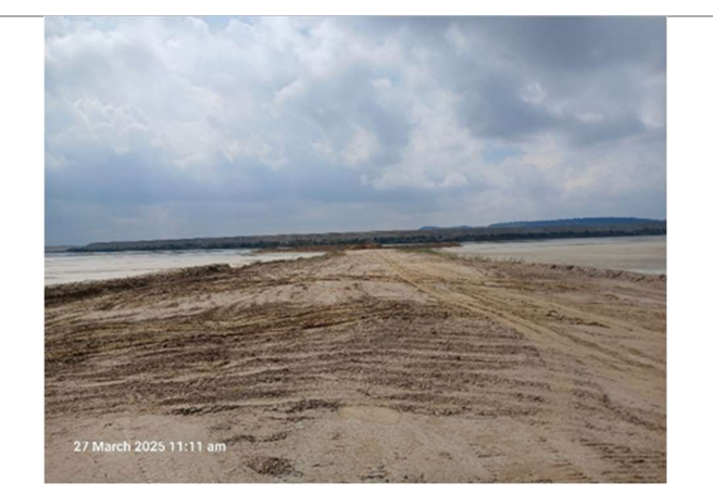
Figure 12: View of the road and the top of the TSFs between the Savuka 7a & 7b TSFs, looking east.