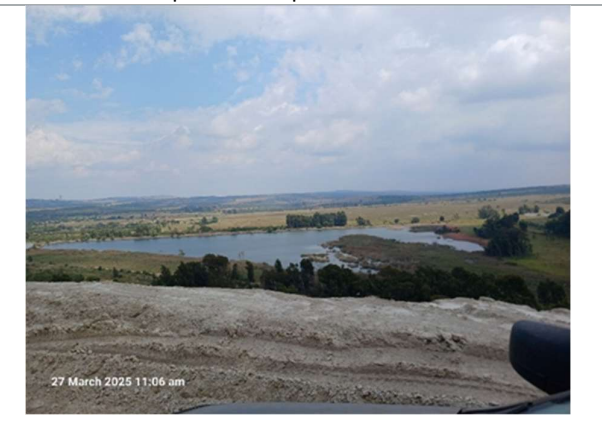
Figure 8: View of the northern part of the stormwater dam and return dam overflow from the top of the TSFs.