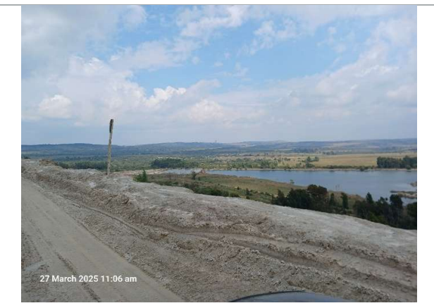
Figure 9: View of the return water dam and the southern part of the stormwater dam and return dam overflow from the top of the TSFs.