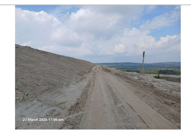
Figure 10: View of the road on the TSF to the west of the study area.