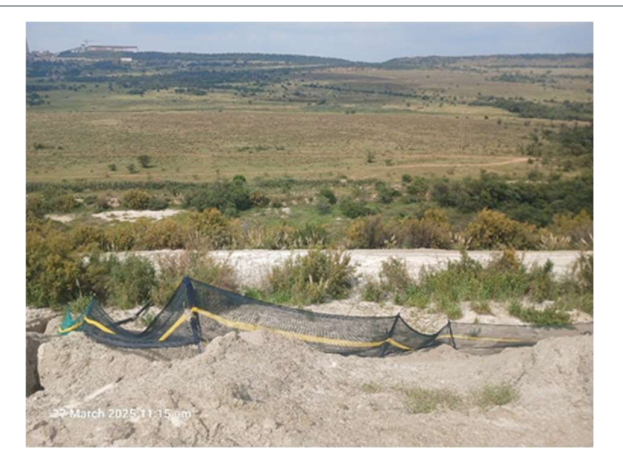
Figure 14: View from the road on the TSFs to the south of the study area towards the south. The netting for dust mitigation is visible in the foreground on the side slopes of the TSFs.