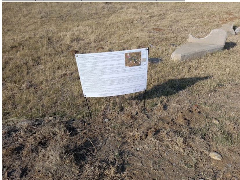
R34 Site Notice

A1 Notice: 25/06/2024 14:58:33; GPS Coordinates: -27.899311, 26.664803