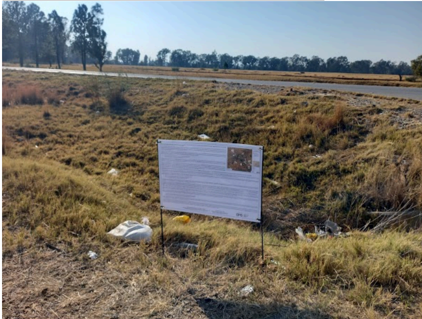
R30 Site Notice 2

A1 Notice: 25/06/2024 14:40:50; GPS Coordinates: -27.957972, 26.690385