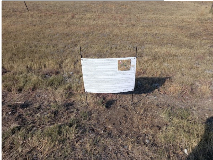
R34 Site Notice 2

A1 Notice: 25/06/2024 15:00:37; GPS Coordinates: -27.904615, 26.646290