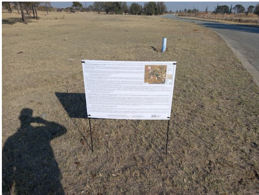
R30 Notice 3

A1 Notice: 25/06/2024 14:53:08; GPS Coordinates: -27.915119, 26.693348