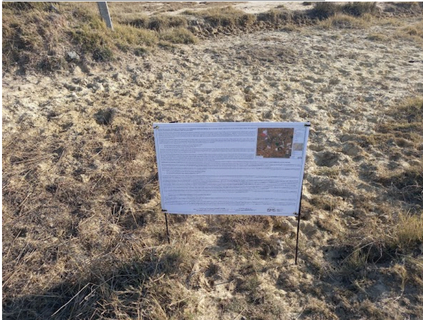
Site Notice 5

A1 Notice: 25/06/2024 14:46:26; GPS Coordinates: -27.945484, 26.680416