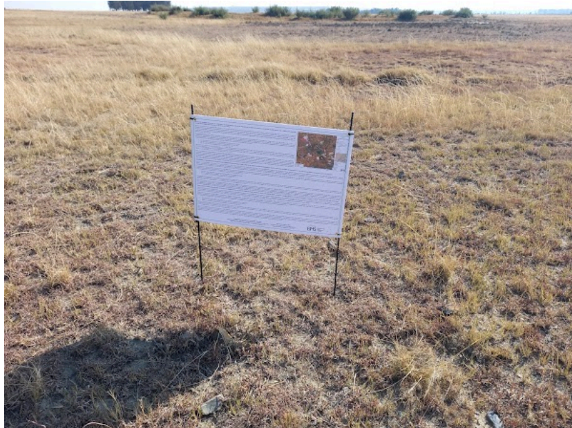
Site Notice 10

A1 Notice: 25/06/2024 15:03:29; GPS Coordinates: -27.948032, 26.675007