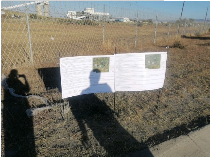
Site Notice 8

Site Notice: 03/07/2023 16:02:28; GPS Coordinates: -25.673334, 27.467904