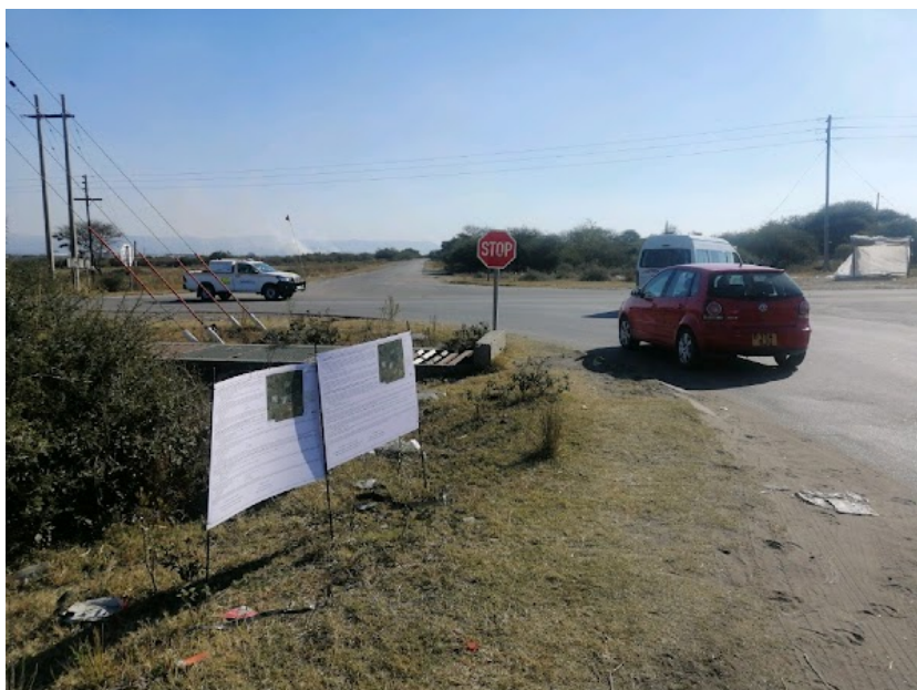
Site Notice 9