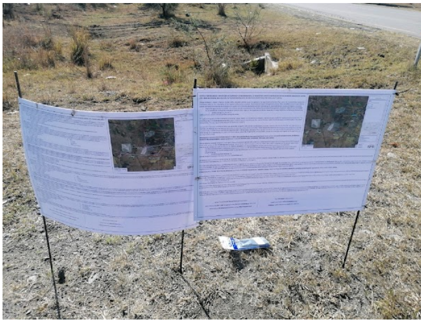
Site Notice 6