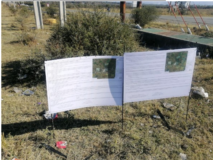
Site Notice 9

Site Notice: 03/07/2023 14:22:04; GPS Coordinates: -25.687742, 27.371482