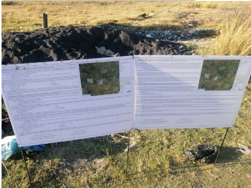
Site Notice 2

Site Notice: 03/07/2023 16:21:35; GPS Coordinates: -25.696315, 27.468609