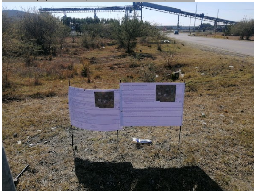
Site Notice 6

A1 Notice: 03/07/2023 13:06:34; GPS Coordinates: -25.695910, 27.450595