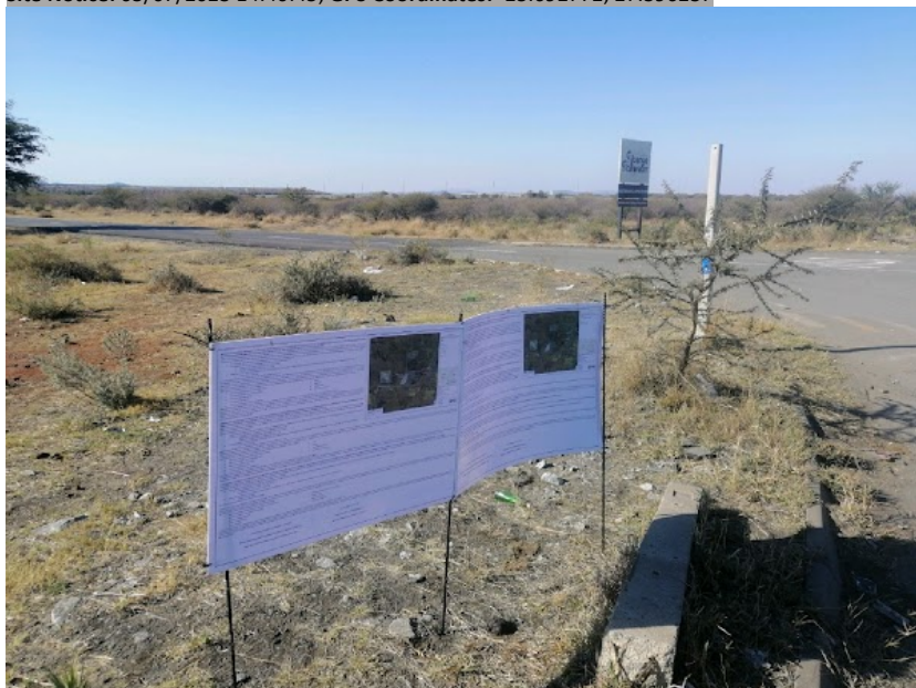
Site Notice 10

Site Notice: 03/07/2023 14:40:45; GPS Coordinates: -25.692772, 27.396237