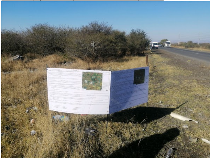
Site Notice 7

Site Notice: 03/07/2023 14:56:35; GPS Coordinates: -25.695610, 27.408476