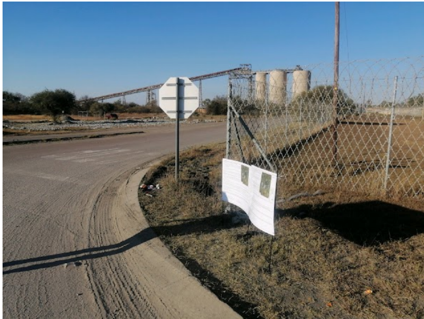
Site Notice 8

Site Notice: 03/07/2023 16:21:35; GPS Coordinates: -25.696315, 27.468609