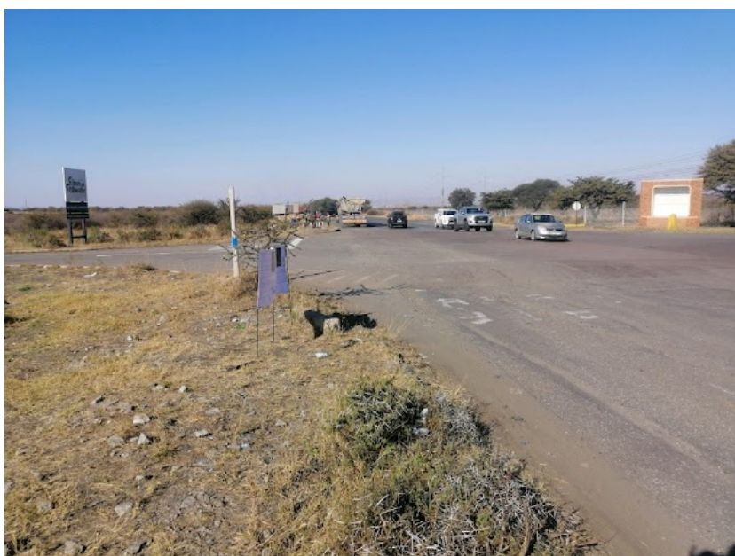
Site Notice 10

Site Notice: 03/07/2023 14:56:35; GPS Coordinates: -25.695610, 27.408476