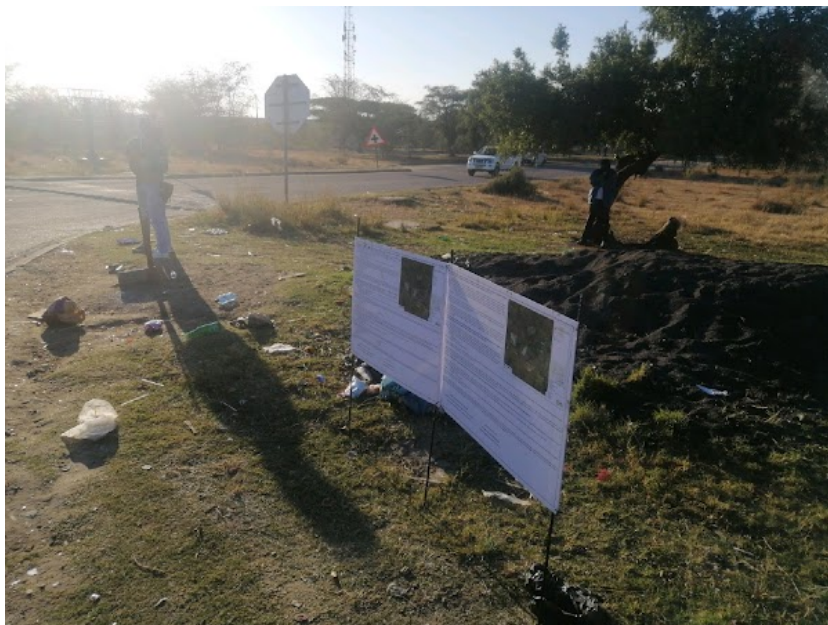
Site Notice 2

Site Notice: 03/07/2023 16:37:18; GPS Coordinates: -25.697179, 27.475711