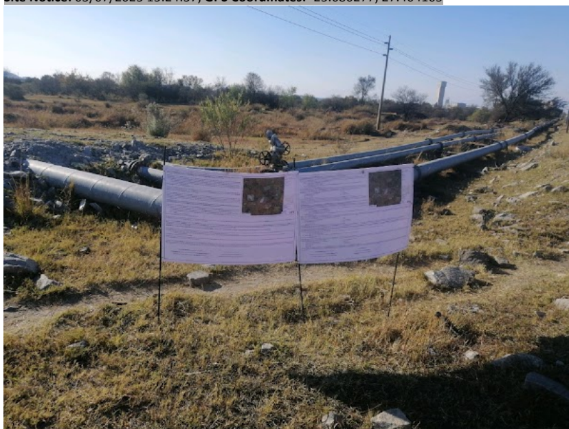
Site Notice 5

Site Notice: 03/07/2023 15:24:37; GPS Coordinates: -25.680277, 27.464105