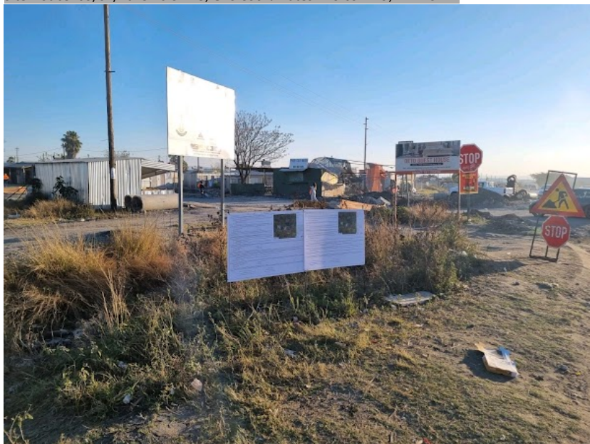
Site Notice 1

Site Notice: 03/07/2023 16:37:18; GPS Coordinates: -25.697179, 27.475711