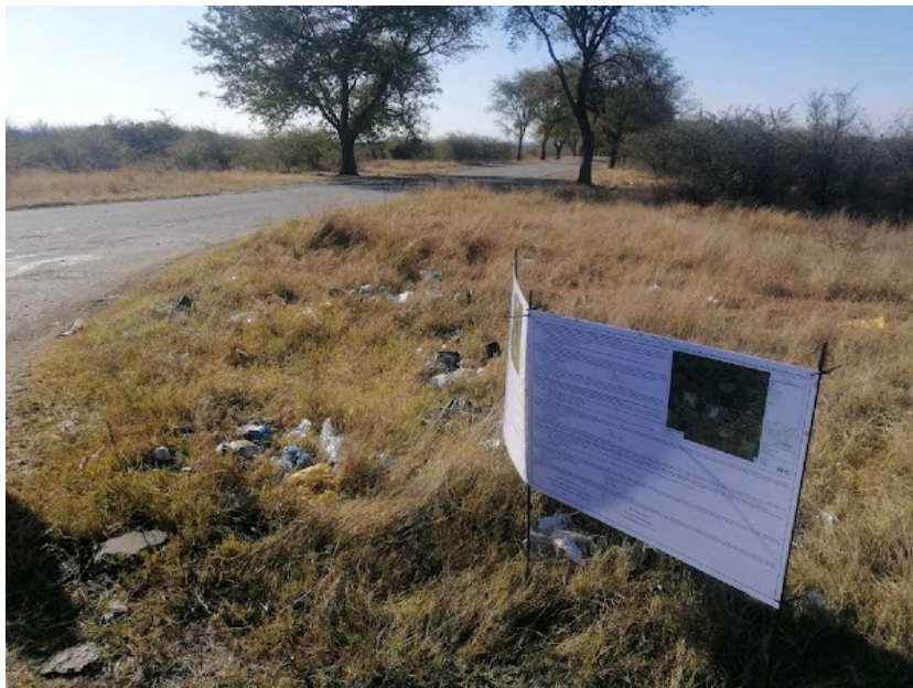
Site Notice 7

Site Notice: 03/07/2023 15:24:37; GPS Coordinates: -25.680277, 27.464105