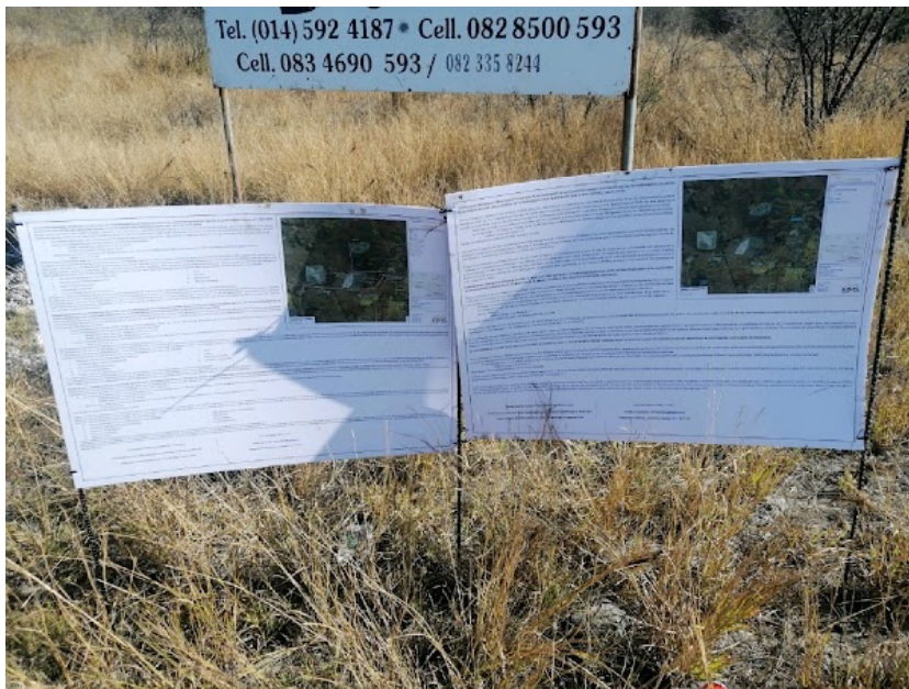
Site Notice 3

Site Notice: 03/07/2023 14:04:07; GPS Coordinates: -25.689705, 27.396323