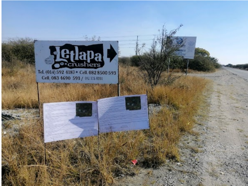
Site Notice 3

Site Notice: 03/07/2023 13:38:36; GPS Coordinates: -25.696503, 27.411866