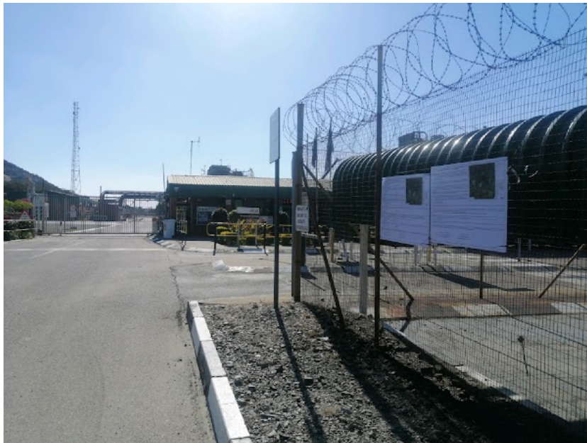
Site Notice 4

Site Notice: 03/07/2023 14:22:04; GPS Coordinates: -25.687742, 27.371482