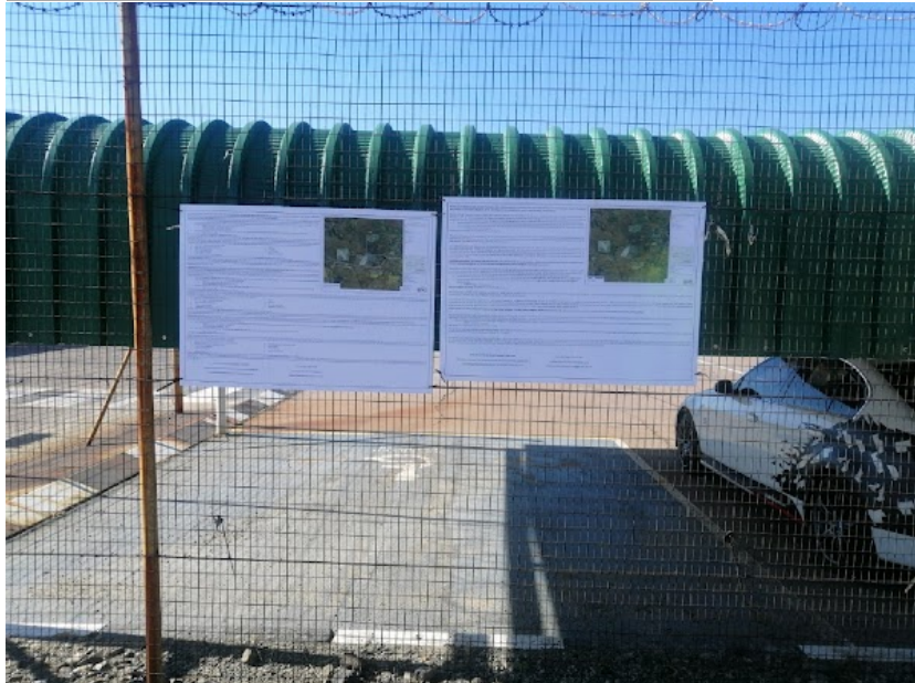
Site Notice 4

Site Notice: 03/07/2023 14:04:07; GPS Coordinates: -25.689705, 27.396323