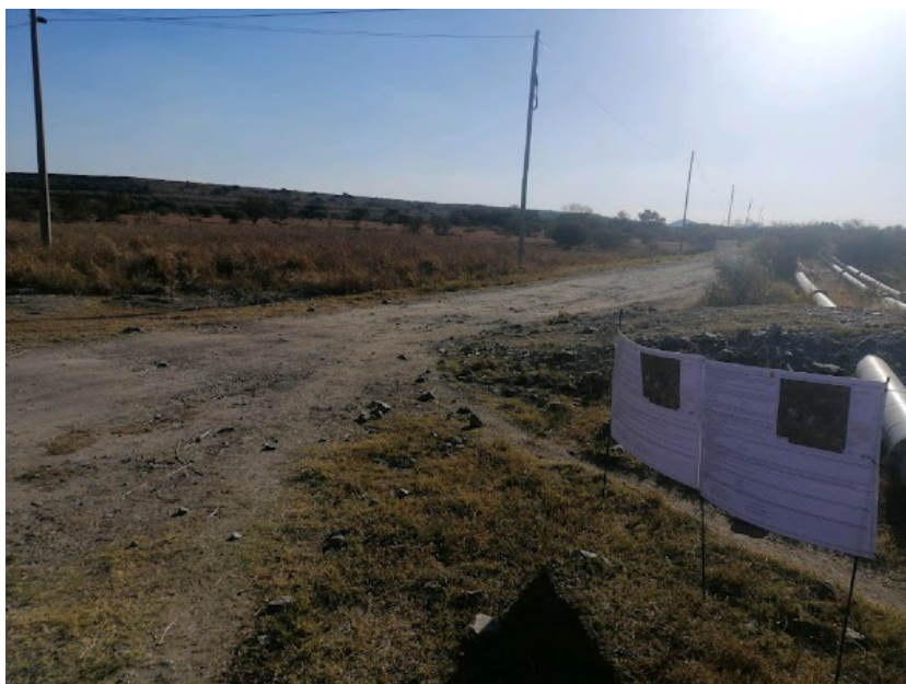
Site Notice 5