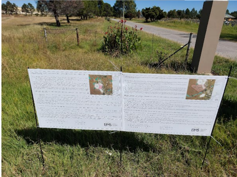
Site Notice 2

Site Notice: 06/04/2023 12:52:34; GPS Coordinates: -27.958118, 26.690526