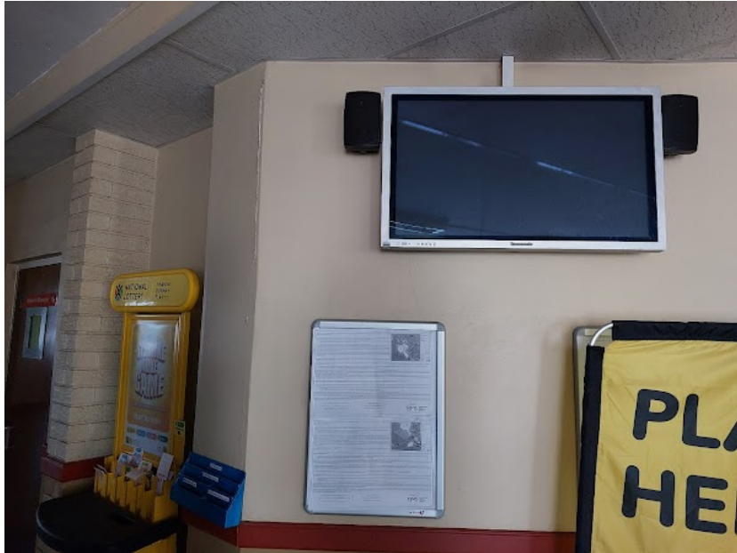
Post Office Notice

A3 Notice: 03/05/2023 10:46:27; GPS Coordinates: -27.981284, 26.734617