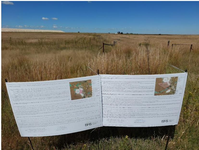
Site notice 6

Site Notice: 06/04/2023 12:54:30; GPS Coordinates: -27.945769, 26.680340