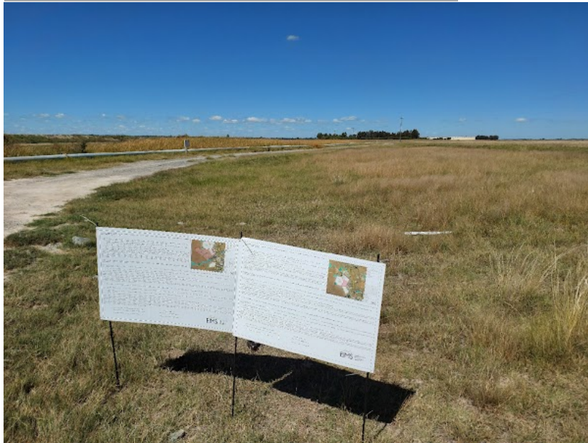
Site notice 9

Site Notice: 06/04/2023 12:55:03; GPS Coordinates: -27.929056, 26.660960