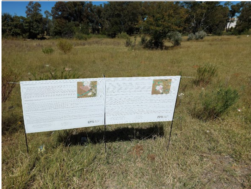
Site notice 7

Site Notice: 06/04/2023 12:54:30; GPS Coordinates: -27.945769, 26.680340