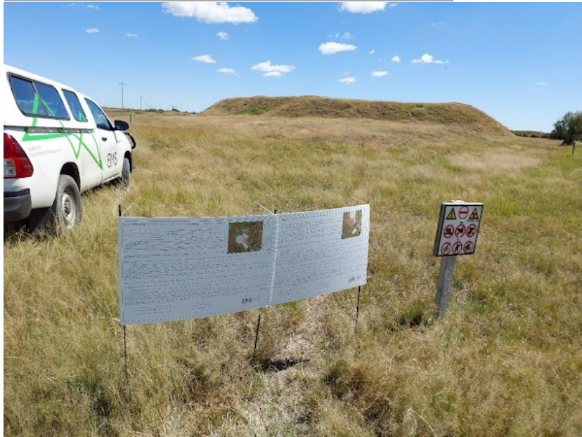
Site notice 10

Site Notice: 06/04/2023 12:55:24; GPS Coordinates: -27.894464, 26.683154