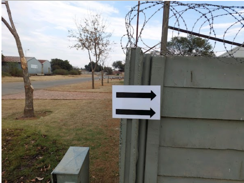
Corner Sign board

: 28/06/2023 16:08:37; GPS Coordinates: -27.937145, 26.818361