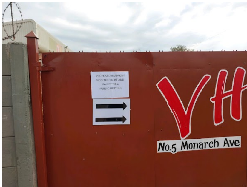
Sign outside venue

: 28/06/2023 16:08:37; GPS Coordinates: -27.937145, 26.818361