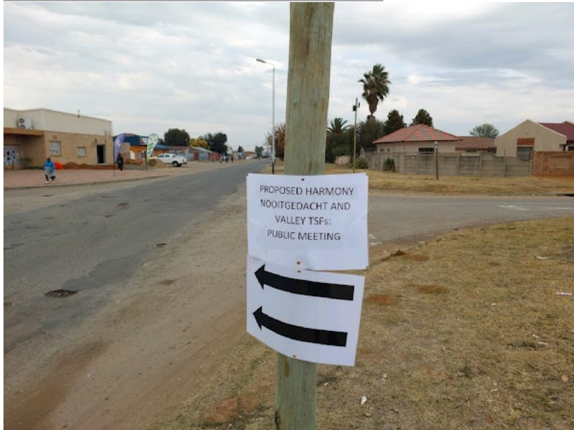
Additional Sign Boards

: 28/06/2023 16:10:25; GPS Coordinates: -27.936330, 26.816687