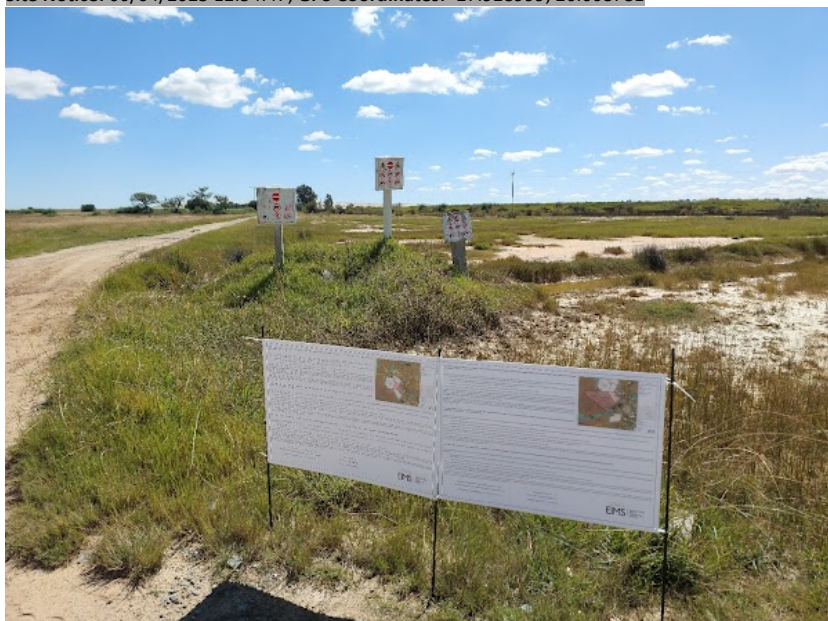
Site notice 8

Site Notice: 06/04/2023 12:54:47; GPS Coordinates: -27.928999, 26.668781