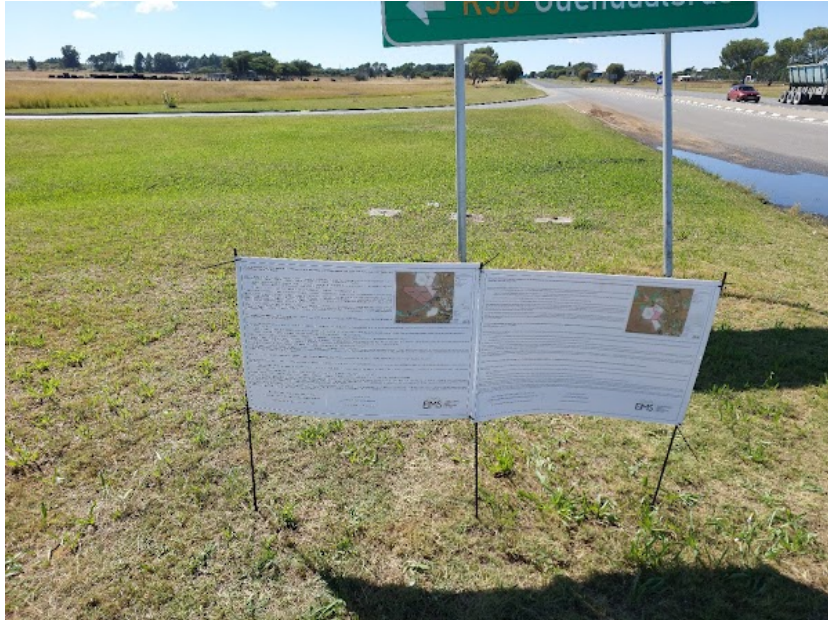
Site Notice 1

Site Notice: 06/04/2023 12:51:30; GPS Coordinates: -27.972939, 26.688219