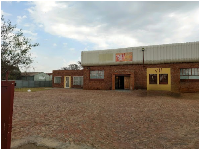
Public Meeting venue

: 28/06/2023 16:06:57; GPS Coordinates: -27.936965, 26.819176