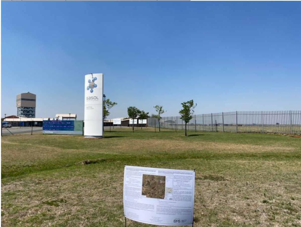
Site Notice 3

: 16/10/2020 10:36:15; GPS Coordinates: -26.710165, 29.172169