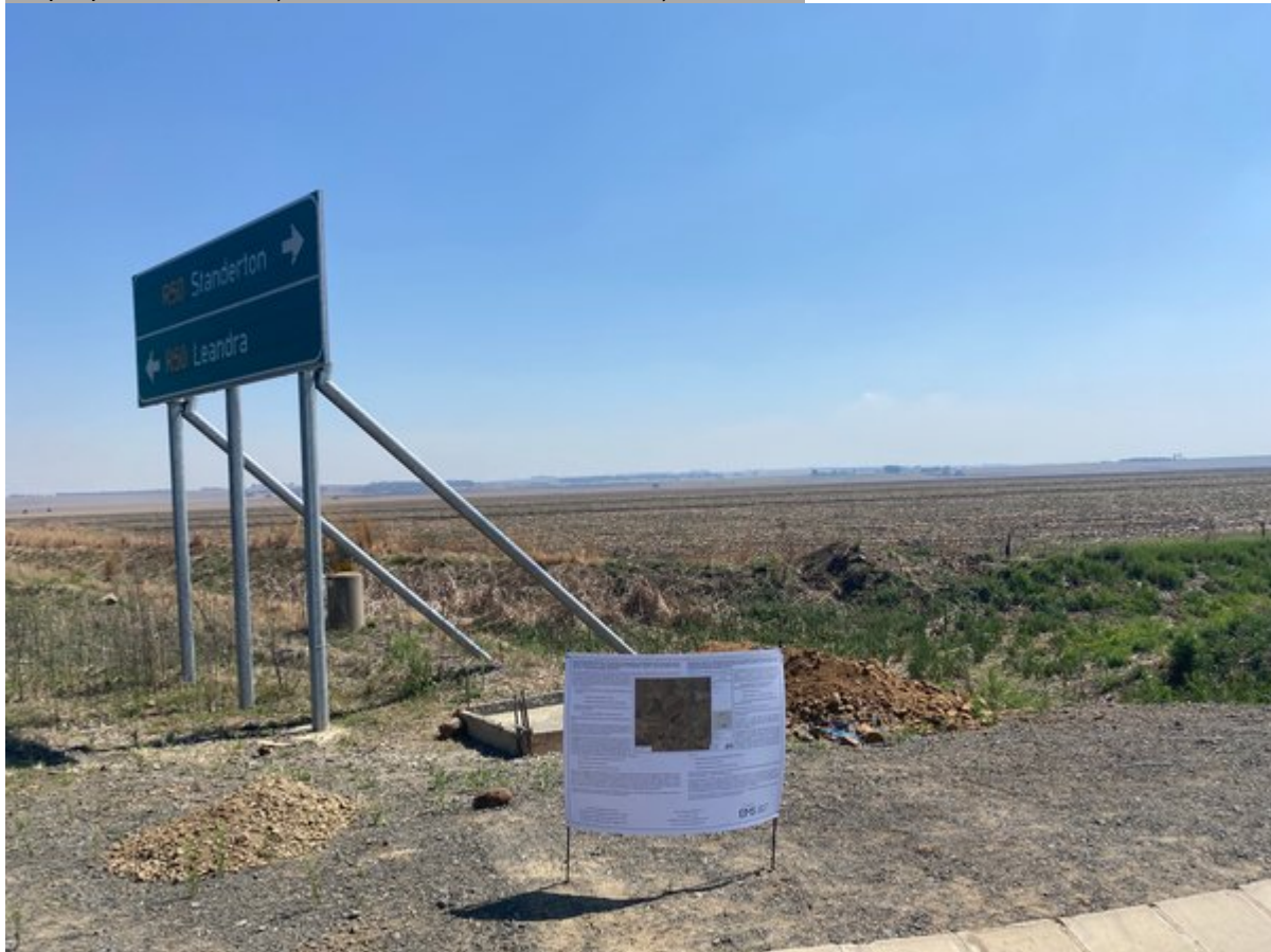
Site Notice 2

: 16/10/2020 09:54:28; GPS Coordinates: -26.777589, 29.086342