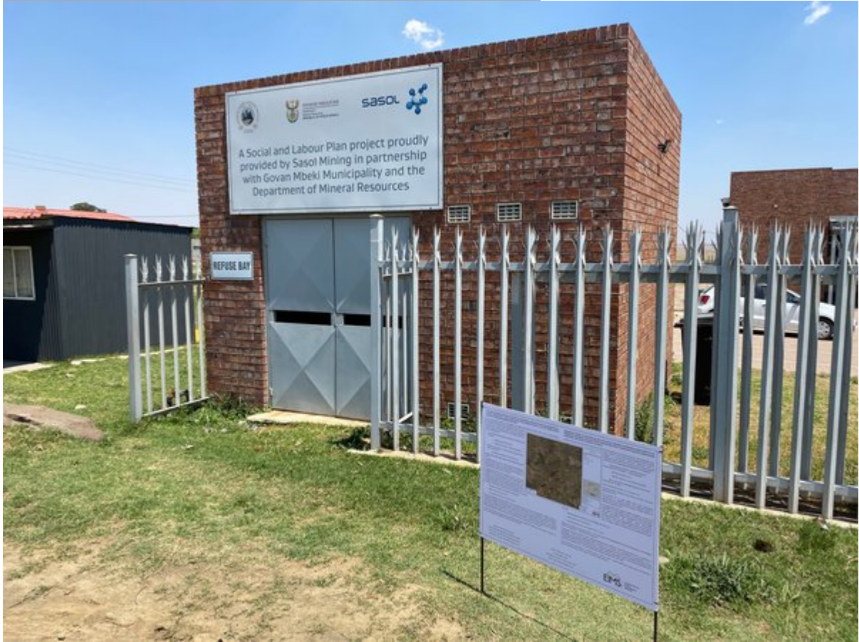
Site Notice 6

: 16/10/2020 12:02:16; GPS Coordinates: -26.662227, 29.183162