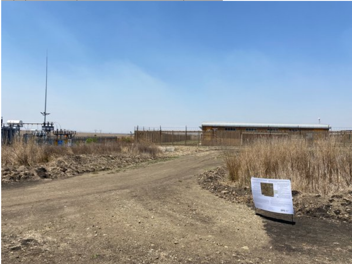
Site Notice 4

: 16/10/2020 11:37:54; GPS Coordinates: -26.693823, 29.186492