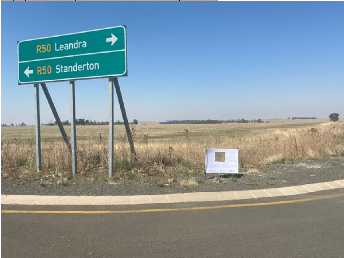
Site Notice 1

: 16/10/2020 09:36:06; GPS Coordinates: -26.777854, 29.085989