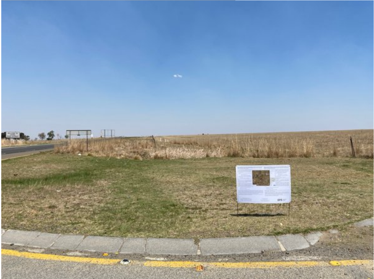
Site Notice 8

: 16/10/2020 12:20:02; GPS Coordinates: -26.704238, 29.191947