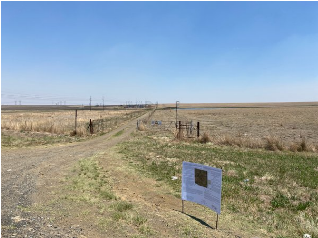
Site Notice 5

: 16/10/2020 12:02:16; GPS Coordinates: -26.662227, 29.183162