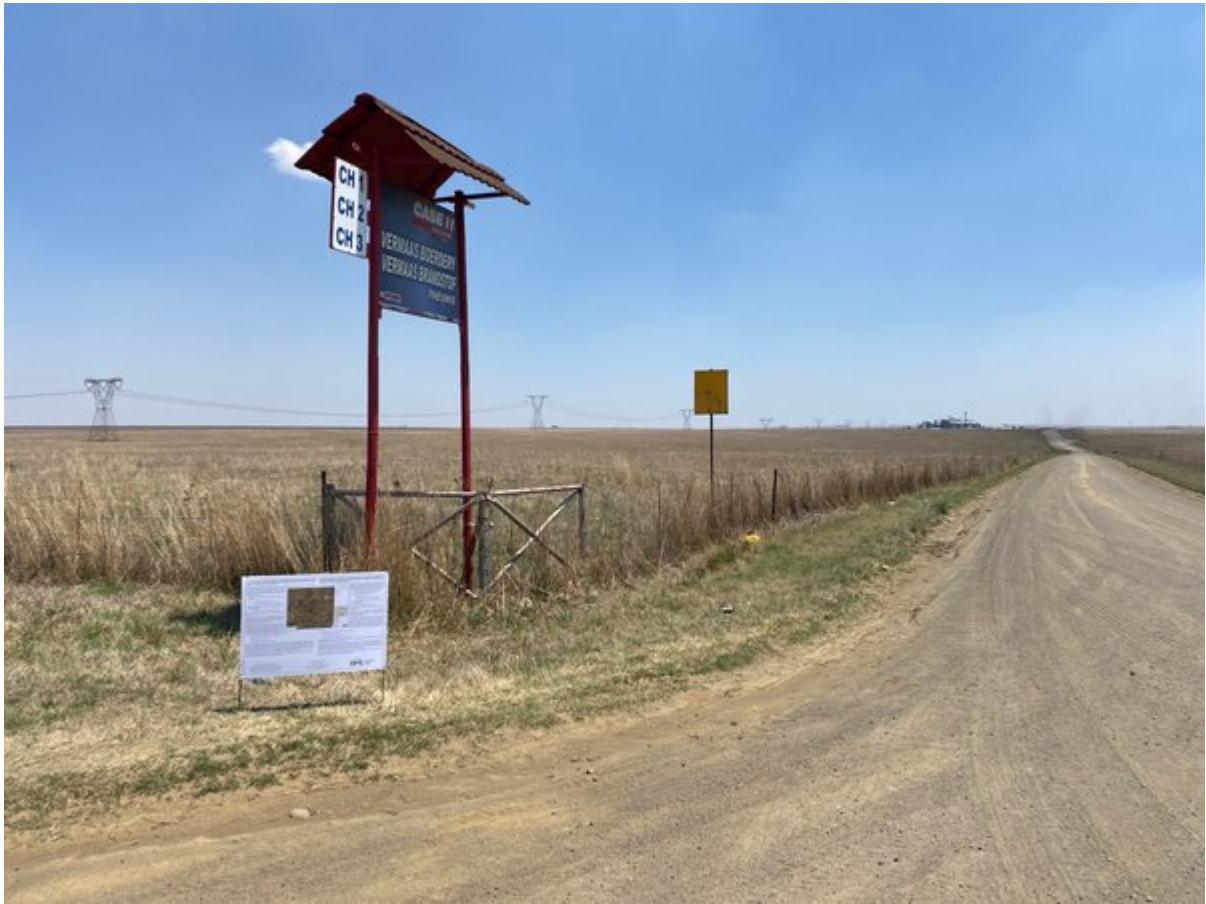
Site Notice 7

: 16/10/2020 12:20:02; GPS Coordinates: -26.704238, 29.191947